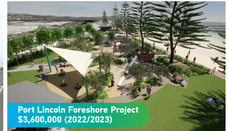
Port Lincoln Foreshore Project $3,600,000 (2022/2023)