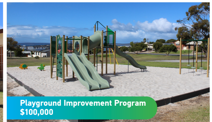
Playground Improvement Program $100,000