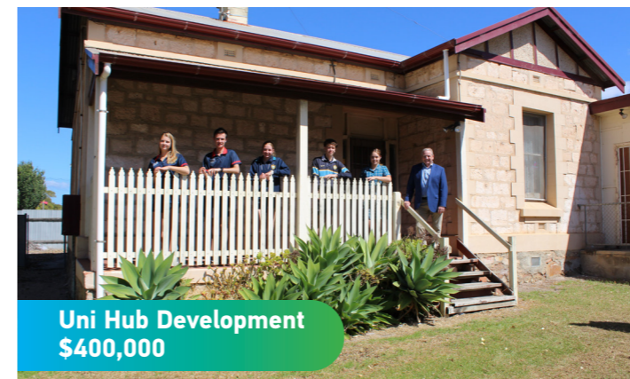
Uni Hub Development $400,000