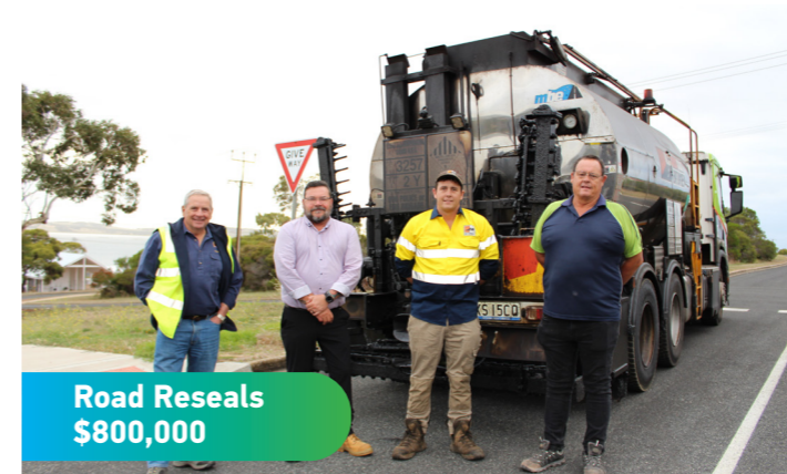
Road Reseals $800,000